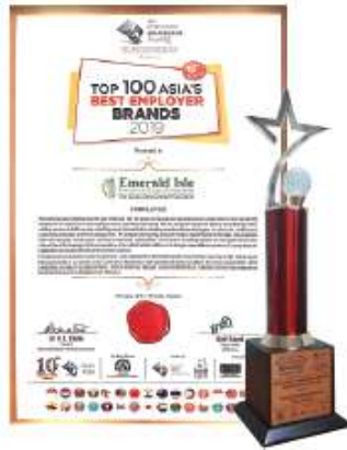
Top 100 Best Employer Brand Award 2019-2020