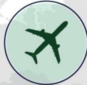
Transport & Airline