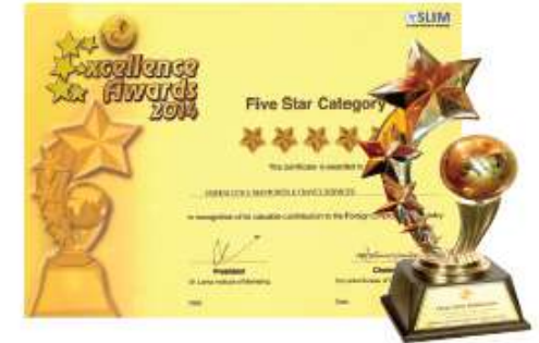
Five Star Award for Excellence in Service-2014