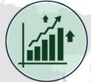
Admin/ Finance & HR