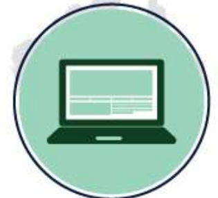
IT & Technology