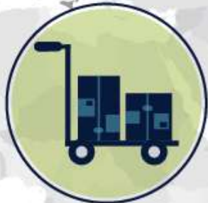
Warehouse & Logistics