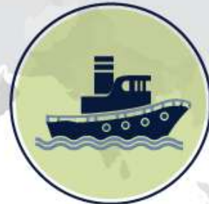
Marine & Port