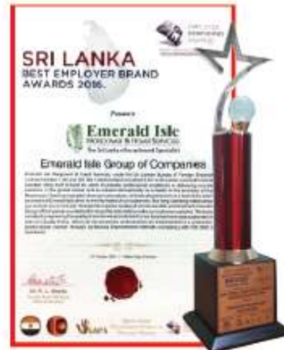
Sri Lanka Best Employer Brand Awards 2016 - 2024