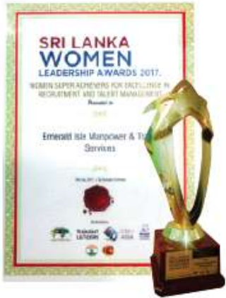
Women Leadership Award - 2017