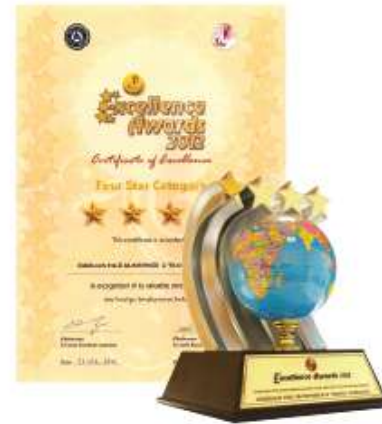
Four Star Award for Excellence in Service - 2012